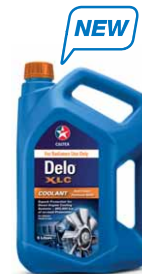
Delo® Extended Life Coolant (Delo® ELC) Delo® Extended Life Coolant Nitrite Free (Delo® XLC) (Premix 50/50)

Formulated with a proven carboxylate additive technology to provide extended life in cooling systems for heavy-duty diesel engines without requiring any supplemental coolant additives (SCAs) to maintain protection.