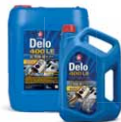
Delo® 400 LE

To learn more about the complete Delo® product line, visit us at www.CaltexDelo.com .