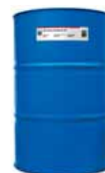
Delo® Gear Lubricant ESI®