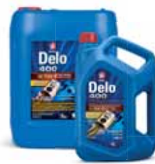
Delo® 400 Multigrade