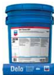
Delo® Grease ESI®