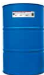
Delo® Synthetic Transmission Fluid SAE 50

Formulated for extended drain and severe service and recommended for factory and service fill of North American heavy-duty manual transmissions, such as those manufactured by Eaton and Mack.