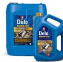
Delo® Gold Ultra